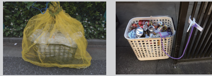
Examples of measures against strong wind scattering